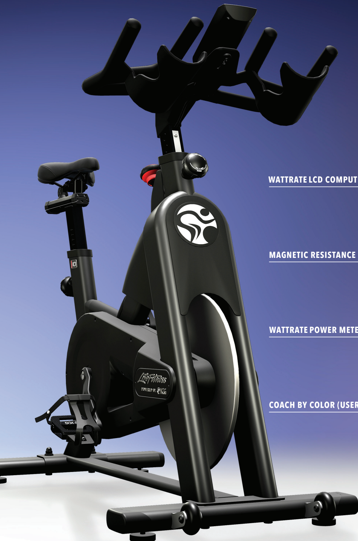
WATTRATE LCD COMPUTER